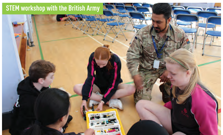
STEM workshop with the British Army